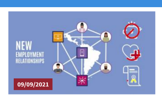
Promoting productive jobs and confronting the challenge of new forms of informal employment