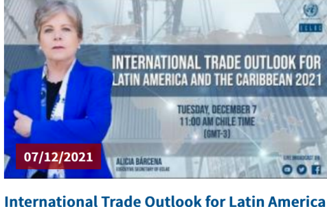
and the Caribbean 2021