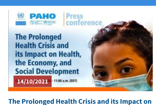
Health, the Economy, and Social Development