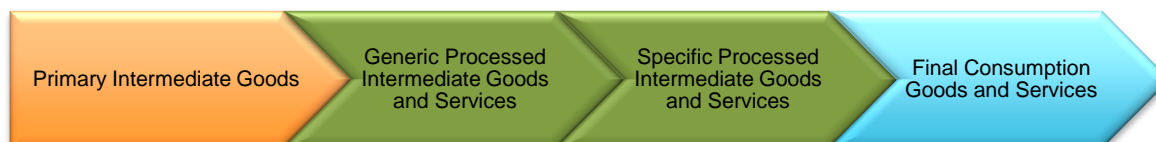
Figure 3. BEC Rev.5, Value Added Chain

25. Figure 3 shows how a general categorization of value added can be extracted from the structure of BEC Rev. 5. This model begins with primary intermediates in the processing dimension, followed by the increasing end-product specificity in the specification dimension (generic and then specific processed intermediates), and end with final consumption goods and services, as depicted in Figure 3.