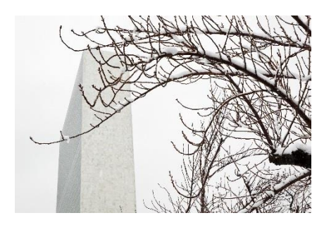
The Committee of the Whole of ECLAC took place at the UN Headquarters in New York

She stressed that gender equality and women's empowerment are a priority, and that women must have access to and full participation in power structures and decision-making. With the adoption of the 2030 Agenda, Member States at the highest level pledged that no one would be left behind, and they committed to "endeavor to reach the furthest behind first". Women must have full access to secure decent jobs. Ambassador King called on ending violence against women and to intensify all necessary efforts to overcome gender stereotypes and the negative social norms.