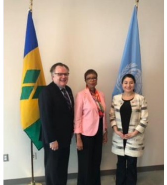
The President of ECOSOC with Ms. Maryam Monsef, Minister of International Development and Minister for Women of Canada