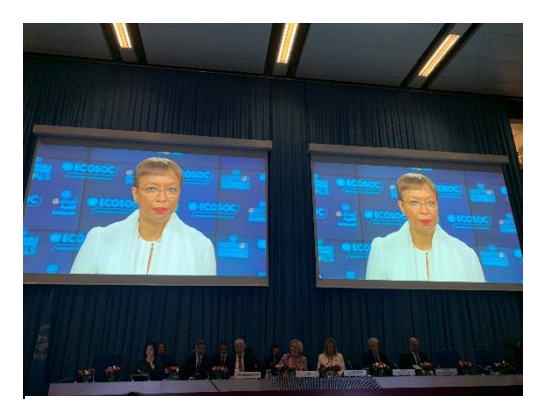
ECOSOC President H.E. Ms. Inga Rhonda King delivers her statement at the opening of the Commission on Crime Prevention and Criminal Institute.

on 20-24 May 2019. The main topics presented at the CCPCJ were on "Preventing and countering crime motivated by intolerance or discrimination" and the "Role of criminal justice systems in enabling sustainable development".