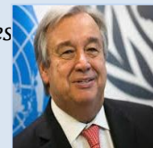
H.E. Mr. António Guterres Secretary-General United Nations

"The next QCPR can look deeply into how the UN development system can ensure accelerated efforts as we embark on the Decade of Action for the SDGs – and help governments recover better from the pandemic. We must continue to step up cooperation in core areas where the interlinkages are strongest and our impact the greatest."