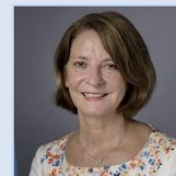
H. E. Amb. Mona Juul President of ECOSOC

“The real challenges, but also the rewards of this Organization, are in the field. And this is the basis of our discussion.