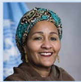
Ms. Amina J Mohammed UNSDG Chair and Deputy Secretary-General United Nations

Framework 3 which has helped change the way UNCTs work, increased Resident Coordinators influence in decision-making and better positioned them to avoid duplication in the work of UN entities. Thirdly, partners and UN entities are increasingly engaged in the work of UNCTs whether physically present in-country or supporting the work from elsewhere, and pooled funding mechanisms are increasingly used, enhancing joint analysis and programming.