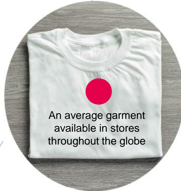
Illustration: Garments VC+LC+HS