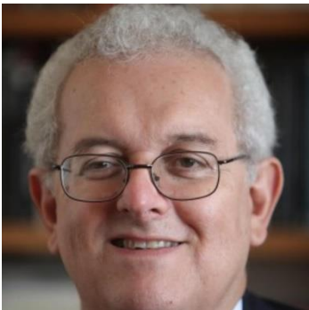
Mr. Jose Antonio Ocampo, Professor at the School of International and Public Affairs, Columbia University and member of the Committee for Development Policy (CDP)