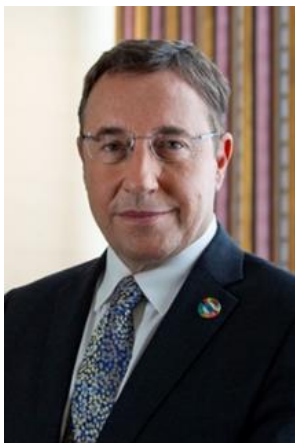
Mr. Achim Steiner, Administrator, United Nations Development Programme (UNDP)

inequality, importance of geography and assets (private or public) in explaining poverty, and in policies oriented towards poverty alleviation based on the role played by infrastructure, institutions, and on how technological breakthroughs (or discontinuities) can improve the welfare of households and small farmers. His experience encompasses Latin America, Sub-Saharan Africa, and Asia.