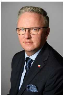
H.E. Mr. Krzysztof Szczerski, Permanent Representative of Poland to the United Nations and Vice-President of ECOSOC and Chair of the Commission for Social Development (CSocD) on its 63 rd session