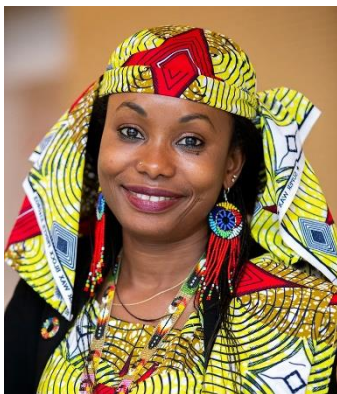
Ms. Hindou Oumarou Ibrahim, Founder of the Association for Indigenous Women and Peoples of Chad (AFPAT) and Expert in Indigenous Peoples' traditional ecological knowledge and climate change adaptation and mitigation strategies, and Chair of the Permanent Forum on Indigenous Issues (PFII) on its 23 rd session

From 2014 to 2017, she served as an independent expert on the UN Human Rights Council Advisory Committee. She has also served as an independent expert elected in respect of Romania on the Council of Europe Advisory Committee of the Framework Convention for the Protection of National Minorities (FCNM) from 2016 to 2020 and has continued in this capacity from 2022 onward.