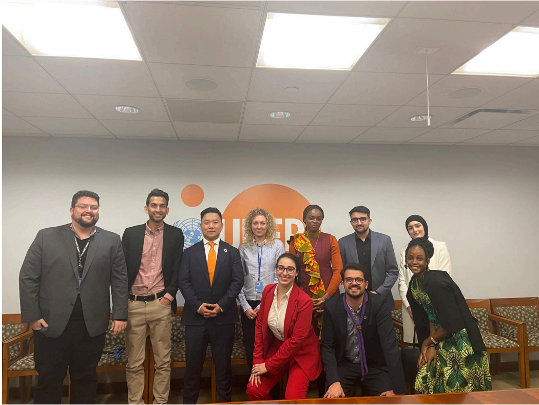
A group photo - in-person